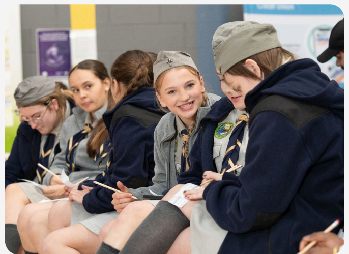
Balbriggan Polish Scouts